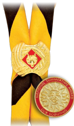
Wolf Cub Scout Neckerchief No. 00802 Slide No. 80000 Pin No. 14333