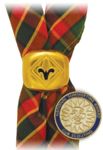
Webelos Scout Neckerchief No. 80890 Slide No. 00891 Pin No. 14335

And now it is—the National Summertime Pack Award recognition pin is changing! Now a boy who actively participates in his pack's summer activities and earns the Summertime Pack Award each year earns a different pin that matches the neckerchief slide of his program level. By the time he is a second-year Webelos Scout, he can sport four different pins: orange from when he was a Tiger Cub, red for his Wolf Cub Scout summer, green that he earned when he was a Bear Cub Scout, and navy as a Webelos Scout.