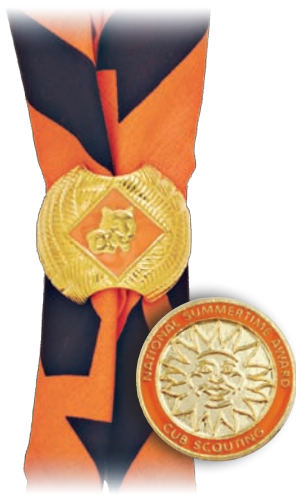
Tiger Cub Neckerchief No. 80871 Slide No. 80870 Pin No. 14332

A CUB SCOUT PACK'S SUMMER PROGRAM IS DIFFERENT EACH YEAR; THE AWARD SHOULD BE DIFFERENT, TOO.