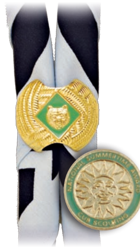
Bear Cub Scout Neckerchief No. 00801 Slide No. 80001 Pin No. 14334